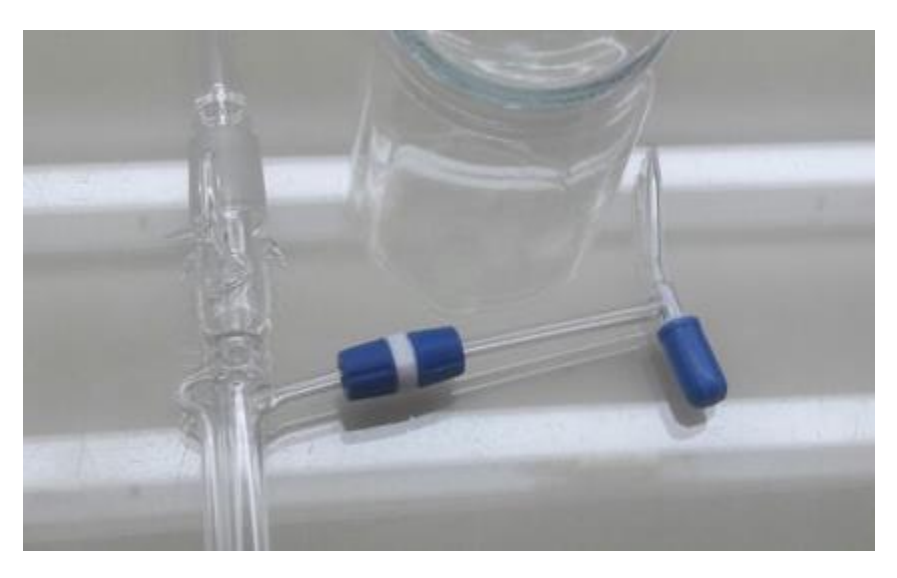
Joint both tubes with center part of adapter. Tighten screw to avoid leakage.

Insert screw cap of adapter on both ends of tubes with threads on outer side, Put silicon sleeve on both ends of inclined tube of automatic burette.