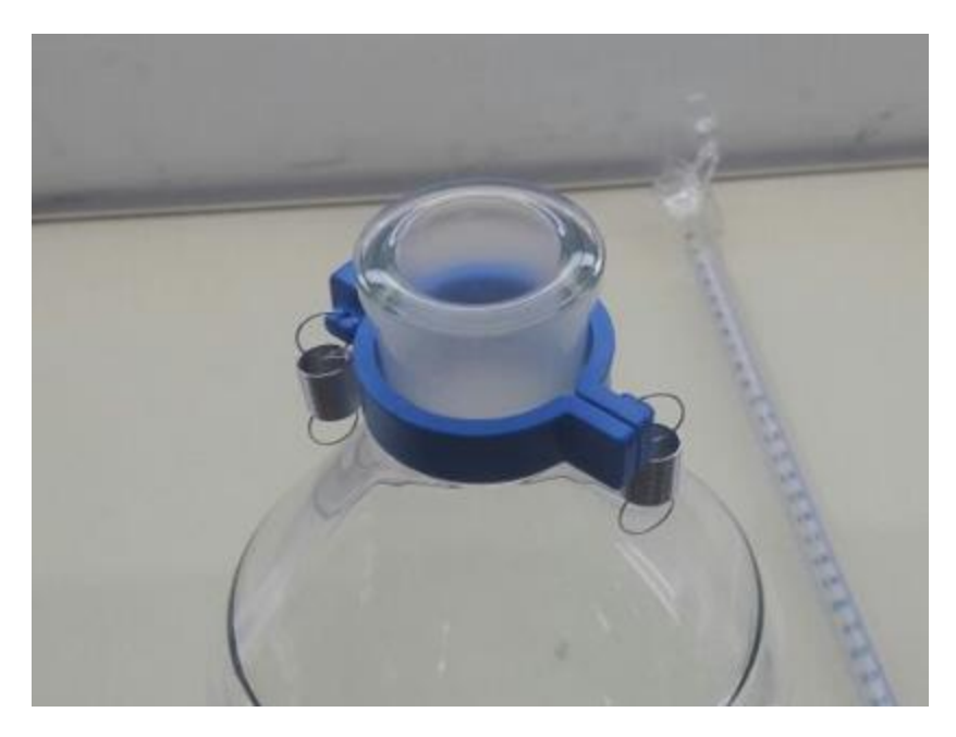
Assemble clamp on bottle neck, & place springs on possition