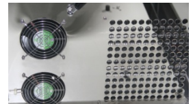
Forced Air Convection