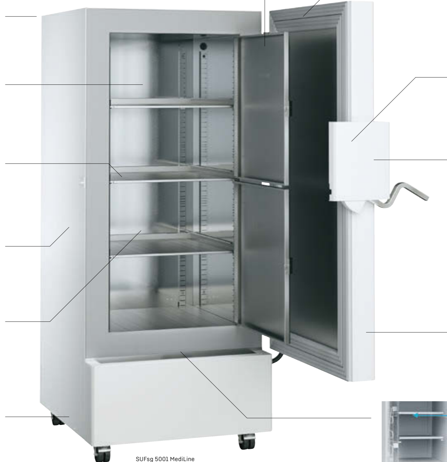
SUFsg 5001 MediLine

When the door is opened and closed, the air exchange creates a vacuum which makes it difficult to open the door again immediately afterwards. The heated pressure compensation valve quickly equalises the vacuum and the door can be easily opened again after just a few seconds.