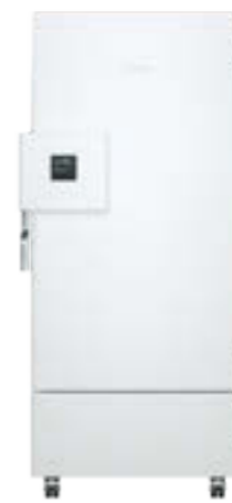
SUFsg 5001 MediLine