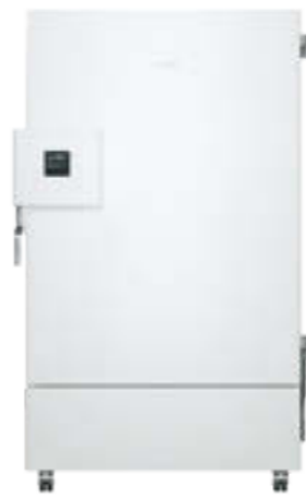
SUFsg 7001 MediLine