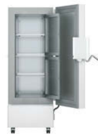
SUFsg 3501 MediLine